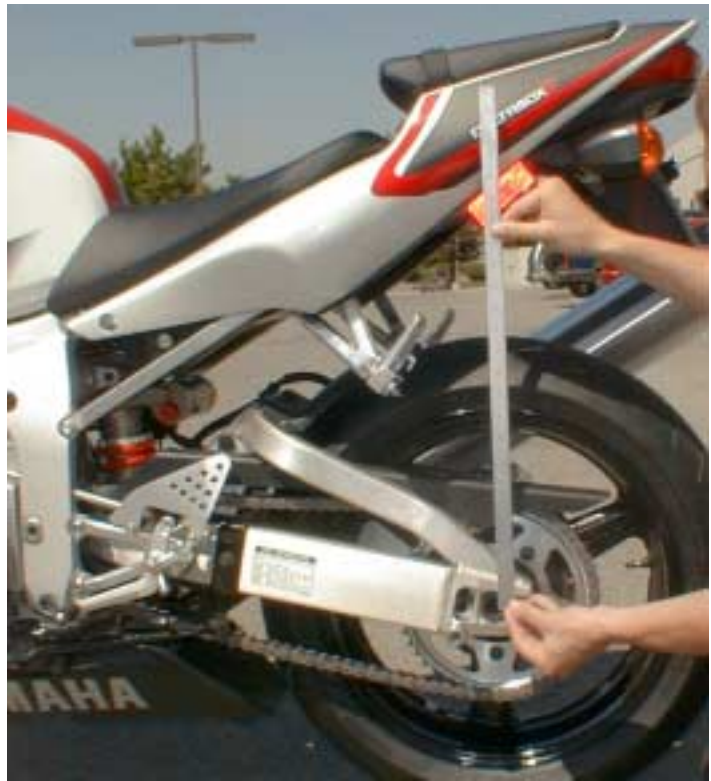
Figure 1: Measuring from the rear axle to a point on the chassis directly above the rear axle

The following chart will enable you to determine if your spring rate is correct. The measurements given are a guide only; there are no absolute settings that you must stick to.